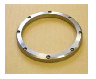
Hydro-Mix VII Ceramic Retaining Ring