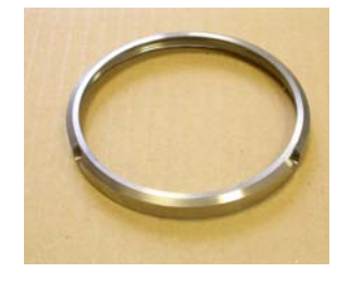
Hydro-Mix VI Ceramic Retaining Ring

In order to ensure continued protection of the Ceramic Retaining Ring, the Protection Ring must also be regularly checked and replaced when worn (details of when replacement is necessary are described in Engineering Note EN0057). If these instructions are N followed, the Protection Ring may wear through to the Ceramic Retaining Ring.